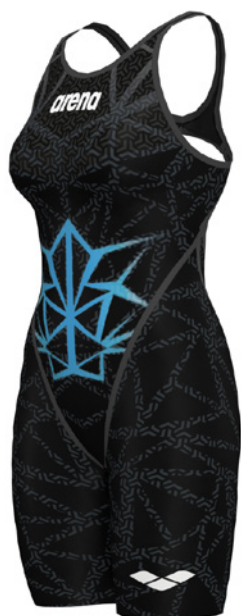
W CARBON GLIDE FBSLO WARRIORS

This feature is delivered by two new advances, Hydroglide fabric and the Micro Carbon Cage, which combine lightness and compression to deliver the ultimate experience in racing performance. Covering the front and lower back, the ultralight, low-profile Hydroglide is smooth to the touch, giving it incredible glide and speed, while also reducing drag and turbulence in critical zones. Covering the legs and lower torso, the similarly ultralight, low-drag Micro Carbon Cage has carbon fibres woven into the fabric in a tight grid-like pattern surrounding specific muscle groups, providing exceptional muscle support and improved body hold to enhance performance without restricting mobility. The result is added stroke power and stability with optimum durability, flexibility, and efficiency. The suit also employs a unique taping structure, with carbon strategically infused into the woven lining to activate major muscle groups, thereby enhancing the swimmer's feeling of support and body hold.