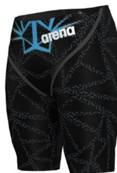
M CARBON CORE FX JAMMER WARRIORS