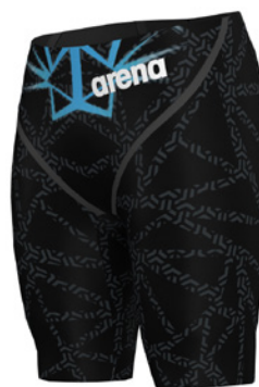
M CARBON GLIDE JAMMER WARRIORS