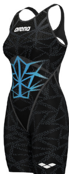
W CARBON CORE FX FBSLO WARRIORS

The Carbon Core FX features a new Twin Taping structure on the back of the legs of both women's suits and men's jammers, providing a lifting effect on the legs that helps the swimmer to hold a high body position even when fatigued, giving maximum hip height in the water. In addition, the internal carbon fibre-infused lining on the women's suit has been extended up the side of the suit with an incision just below the chest, providing multiple benefits: maximum compression and locked-in feel through the legs and torso; an additional, evenly-distributed pressure profile across the body; further improvement of core stability for an enhanced body position in the water with lower form drag; and improved upper body mobility, without compromising overall compression and support.