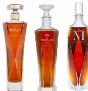
THE MASTERS DECANTER SERIES