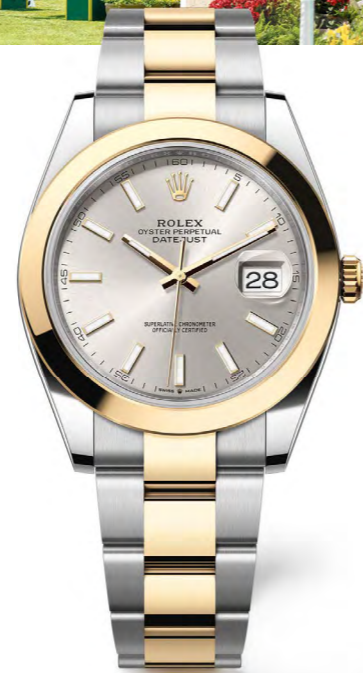
OYSTER PERPETUAL DATEJUST 41