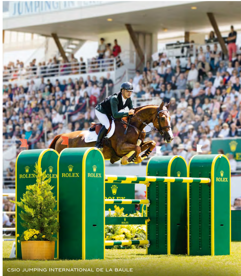
CSIO JUMPING INTERNATIONAL DE LA BAULE