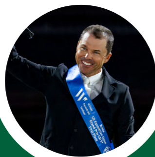
Kent Farrington - Winner of the 2026 Winter Equestrian Festival

Set against an elegant backdrop, the Rolex US Equestrian Open Grand Prix is more than a competition it is a celebration of precision, courage, and equestrian excellence, and a defining moment in the global calendar of elite showjumping.