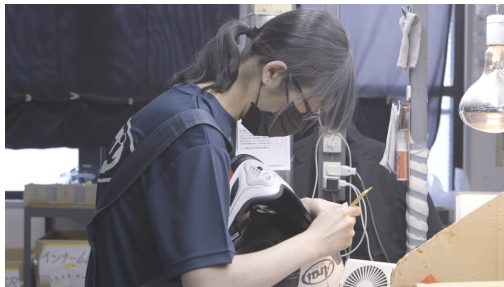
Arai Helmet factory in Japan

“This is truly a privilege! I would like to thank the Motorcycle Federation of Japan for this great honour, and the Tokyo Motorcycle Show for another wonderful event. Every day I am proud of Arai Helmets and what we have achieved over the years. We have always been a family, and it means a lot to be acknowledged by the Hall of Fame. The future is bright for Arai!”